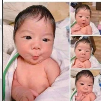
I've tested positive for needing a vacation.